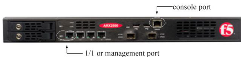
Figure 3.1 ARX-2500 Management Ports

During the initial-boot process (described in this chapter), you can access only the serial (CONSOLE) port. After you boot the switch, you can connect the Ethernet OOB management port to a management station or network. See Connecting the Out-of-Band Management Port, on page 3-18 .