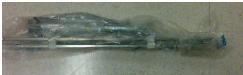
Figure 2.2 Slide-Rail Mounting Kit

The slide-rail mounting kit enables you to slide the switch in or out of the rack for maintenance. You can identify the slide-rail mounting kit by its silver rails. See the following figure.