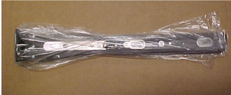
Figure 2.1 Rack-Mounting Ear Bracket Kit

If installing into a two-post cabinet, you can use the rack-mounting ear bracket kit. You can identify this kit by its black rails. See the following figure.