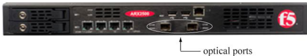
Figure 2.3 ARX-2500 Optical Ports

If you ordered optical transceivers, you can locate them in the Accessory Kit, packaged in their own box. Insert them in the optical ports as identified in the following figure.