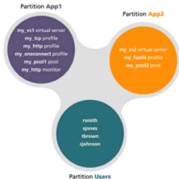
Figure 1: Sample administrative partitions on the BIG-IP system

The following illustration shows an example of user objects within partitions on the BIG-IP system.